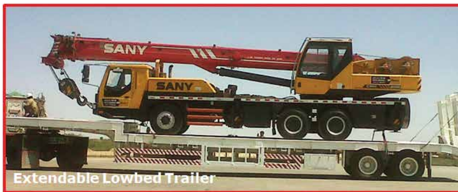
Extendable Lowbed Trailer