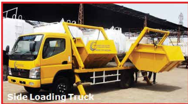
Side Loading Truck