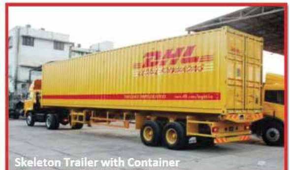
Skeleton Trailer with Container