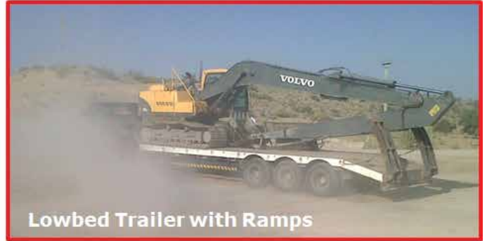
Lowbed Trailer with Ramps