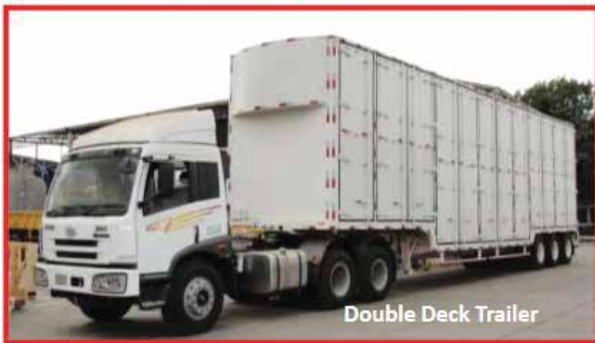
Double Deck Trailer