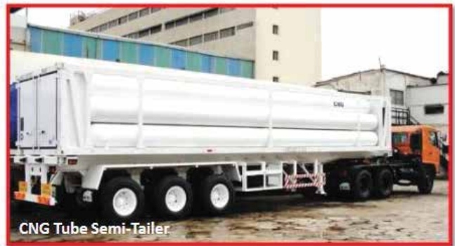
CNG Tube Semi-Tailer